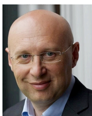
Stefan Hell Nobel Prize 2014