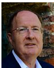
Sir Gregory Winter Nobel Prize 2018